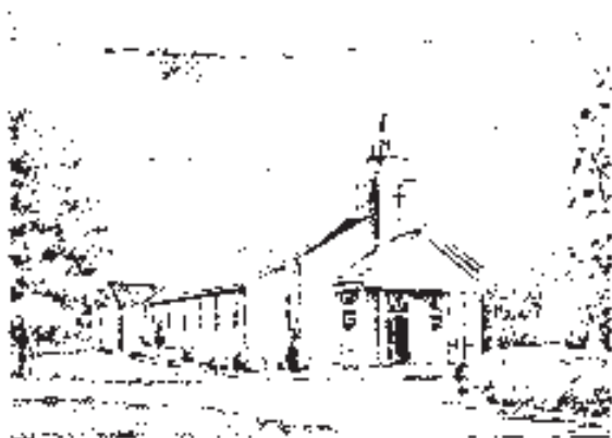
Immaculate Conception 20916 Dalton Road, Box 128, Sutton West, ON L0E 1R0 905-722-3392 www.immaculateconception.on.ca