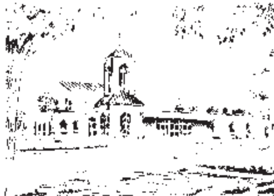
Our Lady of the Lake 129 Metro Road North, Keswick, ON L4P 3C8 Tel: 905-476-0097 Fax: 905-476-0897